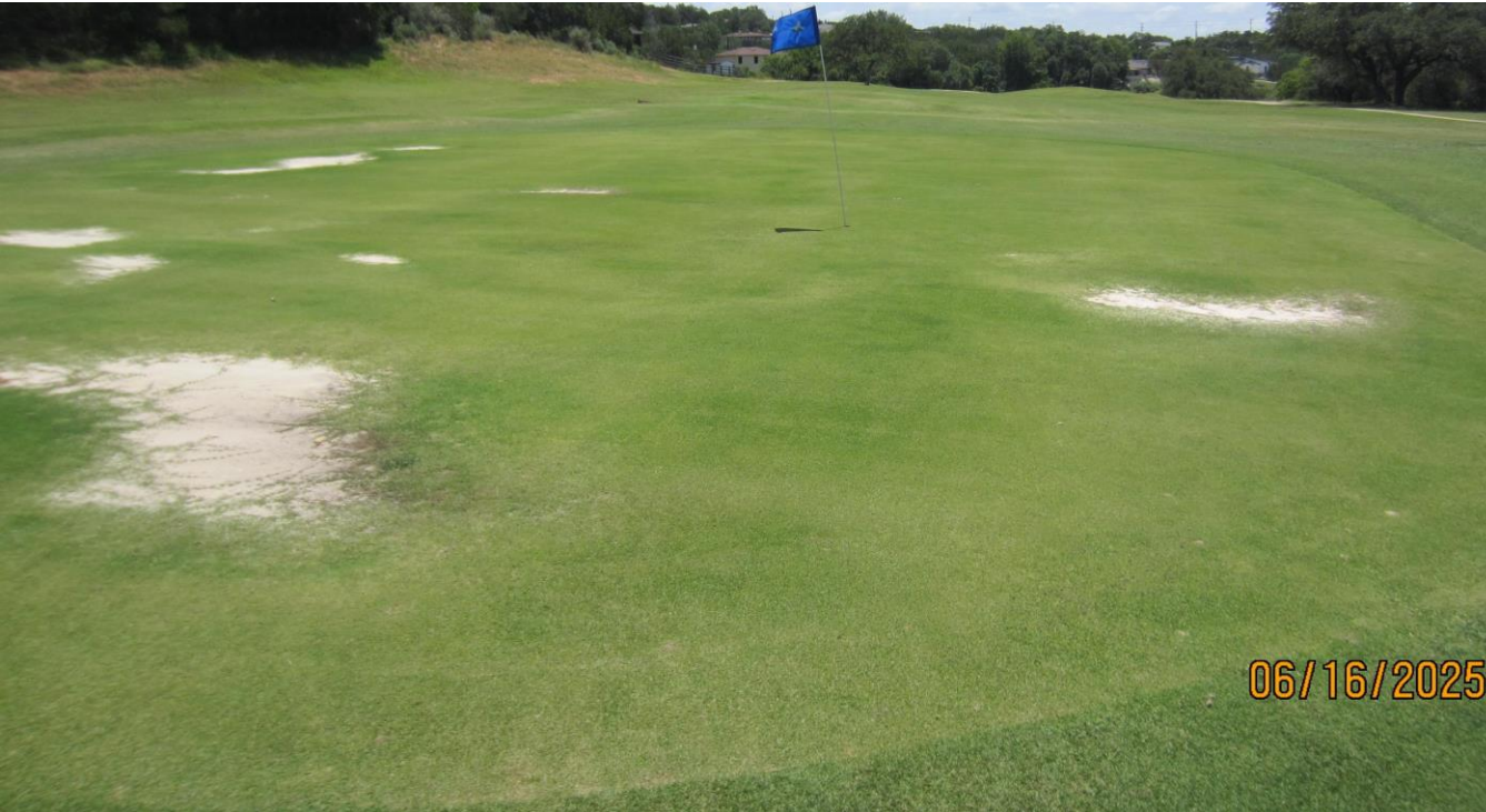
Hole # 7 green (June 2025)