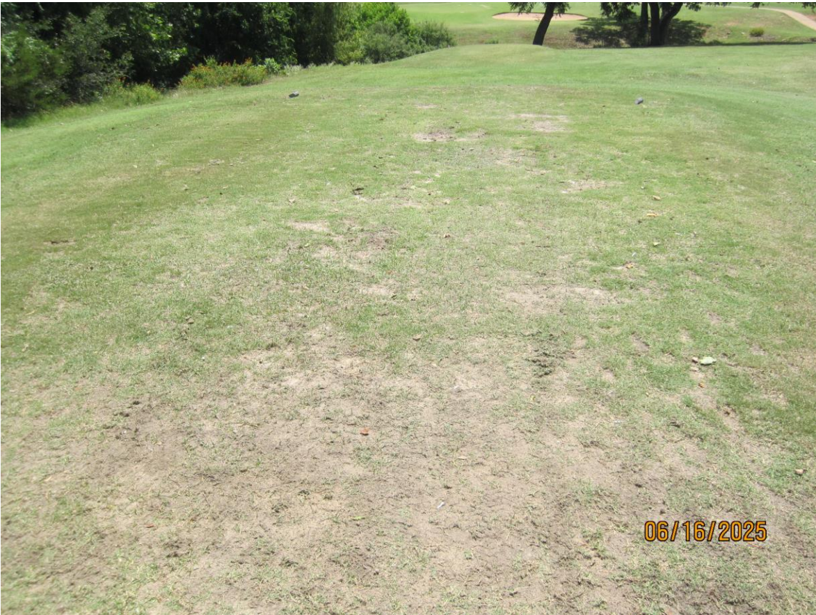
Tee box Example Hole # 3