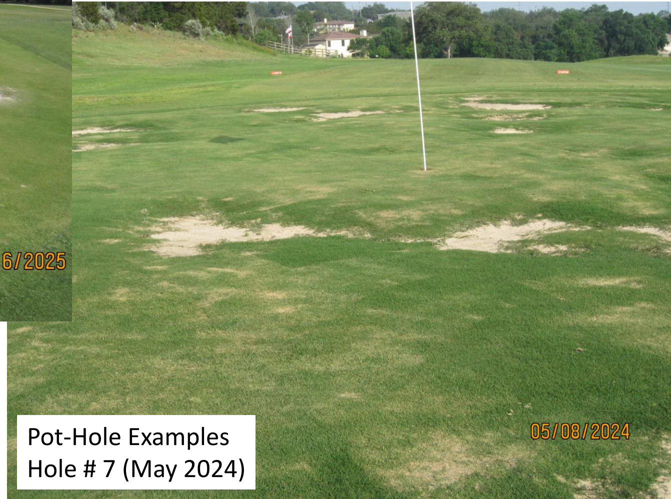
Pot-Hole Examples Hole # 7 (May 2024)