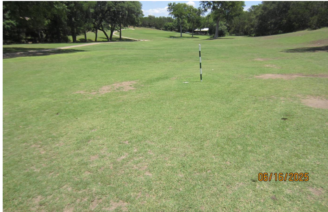
Typical Fairway Example Hole # 11