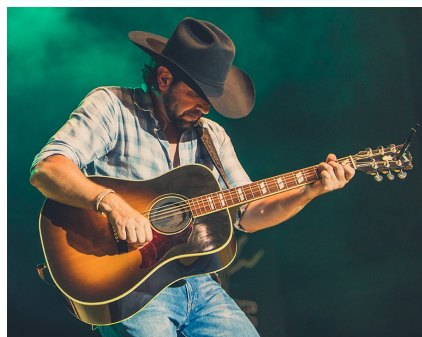
Lago Fest 2023 Headliner: JON WOLFE