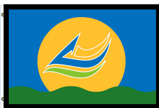
Lago Vista City Flag Winning Design

On November 3, 2022, Resolution No. 22-1961, was approved by a unanimous vote by the City Council to adopt the winning design to be the flag of the City of Lago Vista.